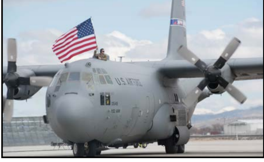
152nd Airlift Wing C-130 carrying Nevada Air National Guardsmen and equipment returns March 6, from a four-month long deployment overseas.