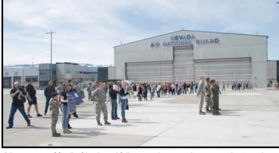
A large group of family, friends and fellow guardsmen and women gather to welcome home a group of High Rollers that returned March 19, from a four-month long deployment overseas.