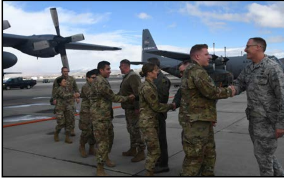
152nd Airlift Wing leadership shakes the hands of Airmen returning from a four-month long deployment on March 6.